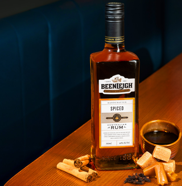
BEENLEIGH SPICED RUM