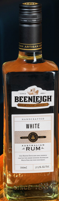
BEENLEIGH WHITE RUM