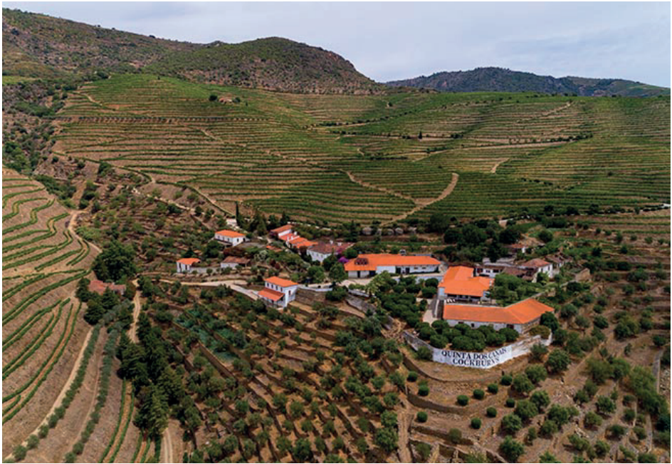
IN THE BACKGROUND, THE 'VINHA DO ALEXANDRE' VINEYARD AT QUINTA DOS CANAIS