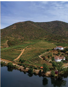
QUINTA DO VALE COELHO

The backbone of the Cockburn's 2016 comes from the mature Bico de Pato ('duck's bill') vineyard, planted at an altitude of 250 metres at Quinta dos Canais. This area is planted with the best Touriga Nacional of the entire estate, which yielded just 1.17Kg/vine. Higher still at 350 metres is the Vinha do Alexandre , the other principal component from Canais, whose west-facing Touriga Franca prospered in the year's abundant heat. This is a late-ripening variety which thrives in dry and warm harvest conditions. Charles commented that in 2016 he was spoilt for choice at Canais; while the estate is largely south-facing, it encompasses varied aspects and altitudes which make for a wide variety of wines.