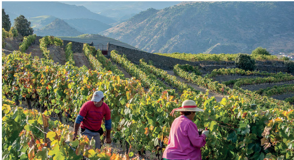
HARVESTING THE 'BICO DE PATO' VINEYARD AT QUINTA DOS CANAIS