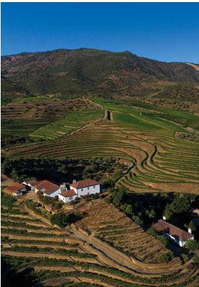
QUINTA DO VALE COELHO

2017 will be remembered as one of the hottest and driest years in the Douro. At Quinta dos Canais we had half the rainfall of an average year (just 246 mm) and temperatures broke several records during the spring. The summer was bone dry, just 6.2 mm recorded in June (monthly average: 24.3 mm), and not a single drop fell during July, August or September. It is quite extraordinary just how well-adapted our indigenous grape varieties are to the Douro's challenging conditions. Fortunately, summer temperatures provided some respite – they were slightly below the 30-year average. This was critically important; if the lack of rain had been combined with extreme temperatures, the outcome could have been very different.