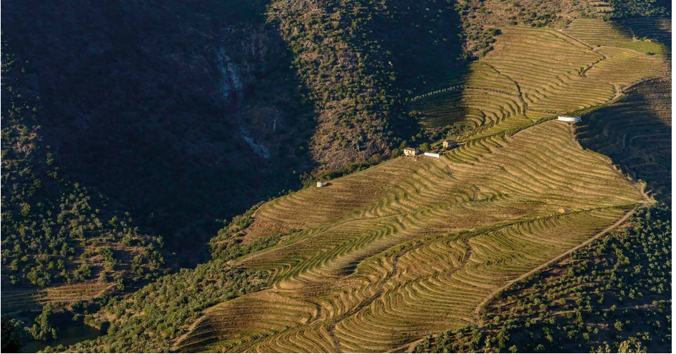
QUINTA DOS CANAIS