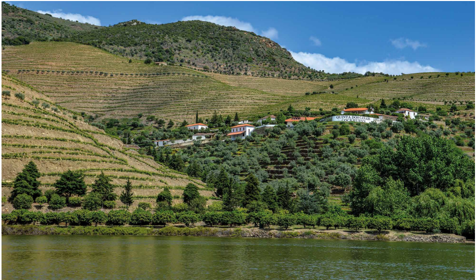
QUINTA DOS CANAIS